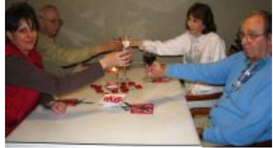
Cheers to Chocolate!